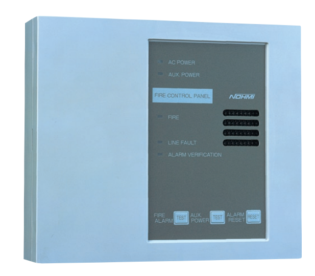
WALL MOUNTING TYPE

On receiving a fire signal from a fire detector or a manual alarm box, the FAP 230N-1L conventional fire alarm panel gives a visual alarm, as well as an audible alarm, to alert the alarm panel operator. It also produces alarms to alert the occupants of the building premises.